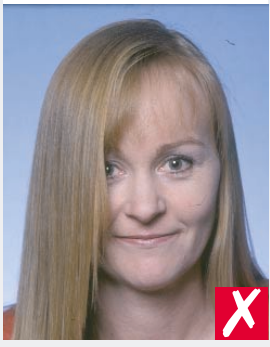
hair across eyes